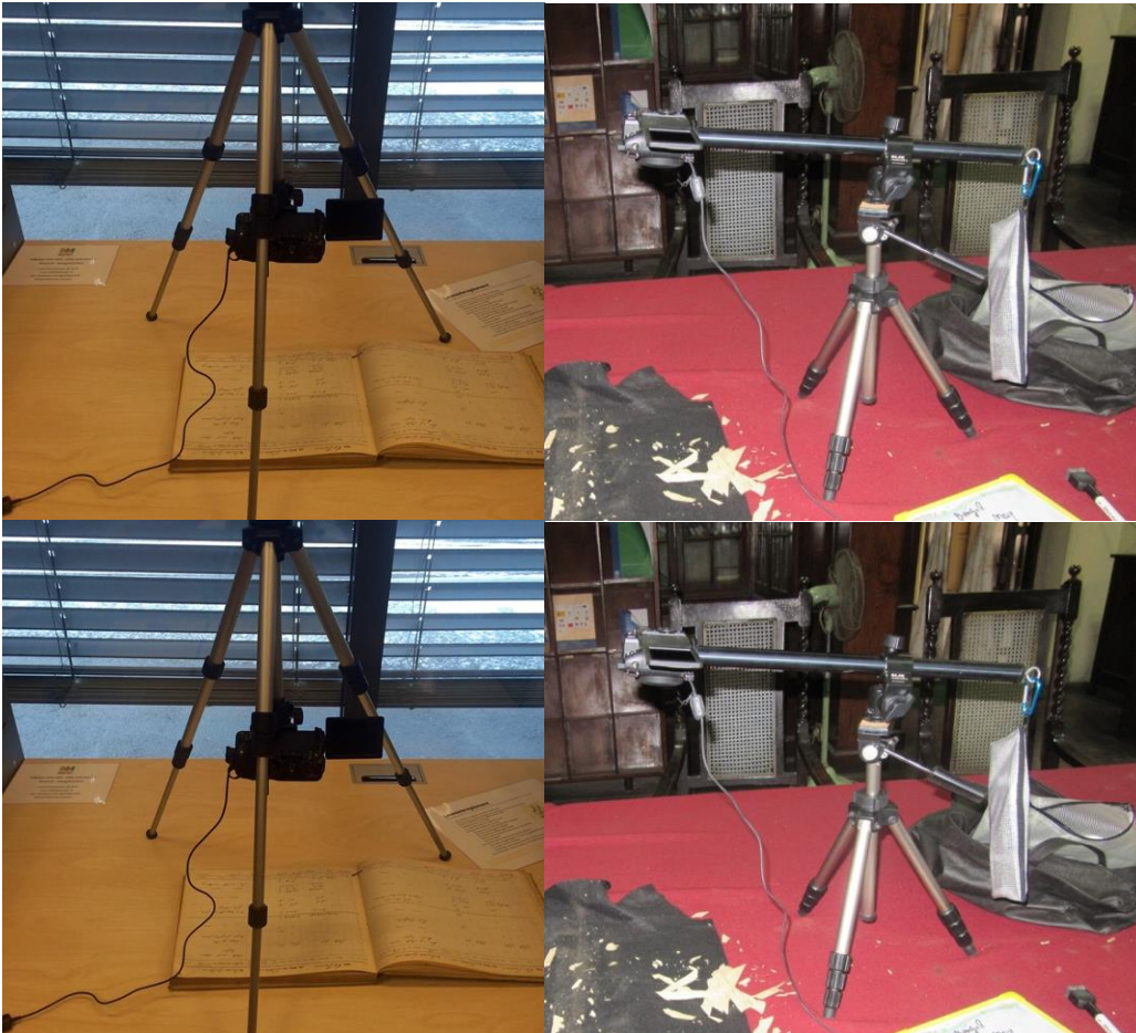
Fig. 3. Camera setup