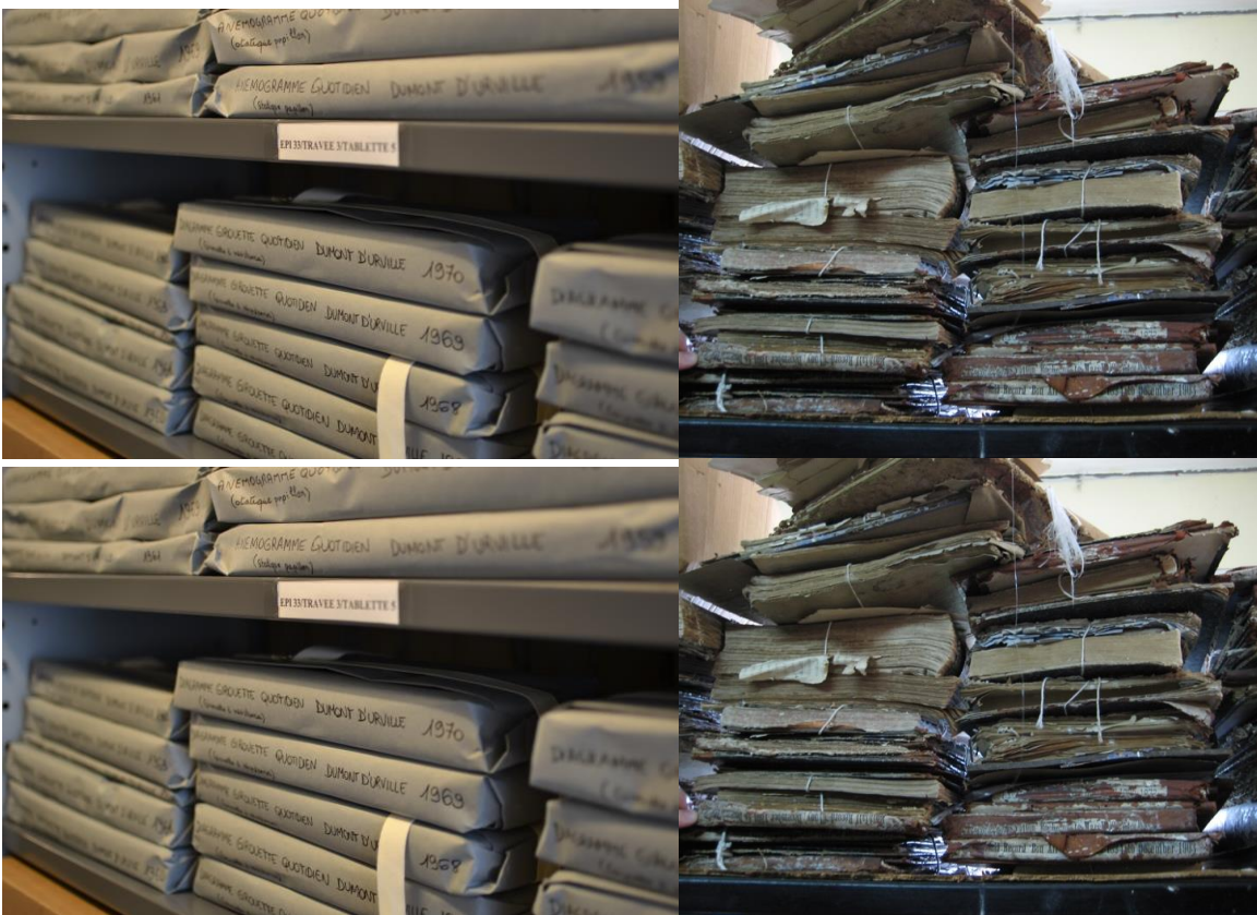
Fig. 2. Contrasting storage facilities. On the left, Météo France, on the right, another archive somewhere in the southern hemisphere.

Fortunately, there are groups such as the International Environmental Data Rescue Organization (IEDRO) and others, working around the world to identify records at risk and undertake data rescue. IEDRO has charitable status. It relies on grants, volunteers, and goodwill to carry out this important work. Through the late 1990s and early 2000s, with funding from the US National Oceanic and Atmospheric Administration (NOAA), IEDRO was able to locate, image, and have digitized tens of thousands of upper-air rawinsonde and PIBAL observations from Kenya, Malawi, Mozambique, Niger, Senegal, Tanzania, and Zambia. These digitized measurements are archived at the NOAA National Centers for Environmental Information. Surface observations from these countries are still on paper and need rescue and digitization. Recently, a very large data rescue project was begun in Uzbekistan to image over 17,000,000 pages of hand-written meteorological surface information. The program was funded by the South Korea Meteorological Administration and administered by the WMO with technical assistance from IEDRO. The National Meteorological and Hydrologic Service of Uzbekistan (Uzhydromet) has already imaged over 4,000,000 pages.